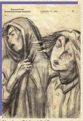
1942. The offensive's main battleground was Singing Girls, 1945

he German army was faced with the need to fight a prolonged war, with all the logistic complications and implications that entailed. The Soviet Army suffered extraordinarily great losses, but nevertheless, was strong enough to begin a counteroffensive early in December, which lasted until March