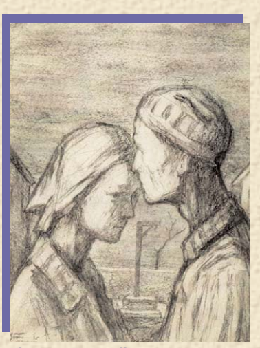
The Last Farewell, 1945

One of the greatest German defeats of the war was in Belorussia. On June 22, 1944, three years after the German invasion of the Soviet Union, the Red Army attacked through a wide front and broke through the German defense lines in several places. Tens of thou-