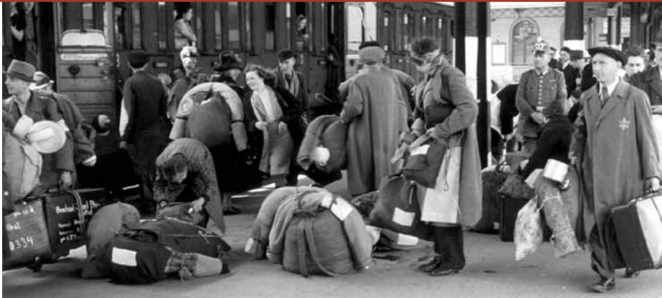
■ Jews gather at a train station prior to deportation, Hanau, Germany, May 1942.

■ “We traveled in ‘omnibus’ cars, like the ones they had before the war. At the end of the car was a wooden bench where the German soldiers sat and watched everyone... it was Friday night. After I finished my Sabbath prayers, I opened the door to jump out. The boys next to me shouted, because the Germans had told us before we left that if anyone tried to escape they’d kill everyone in the carriage. So I sat back down quietly... at a certain point the train slowed down. I ran to the door and jumped. I have no idea what happened next [to the rest of the passengers]...”