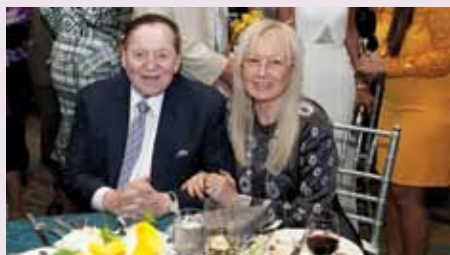
■ Sheldon and Dr. Miriam Adelson