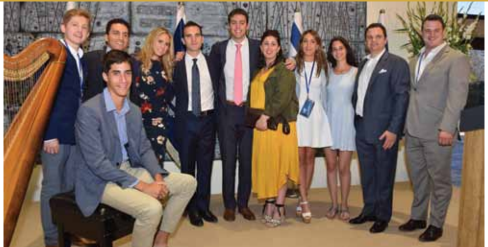
■ Young participants in the 2016 Yad Vashem Leadership Mission: “There is so much more to Yad Vashem”

“ It was so extraordinary to see the preservation process and how pictures and information are scanned into Yad Vashem’s databases. Yad Vashem continues to help