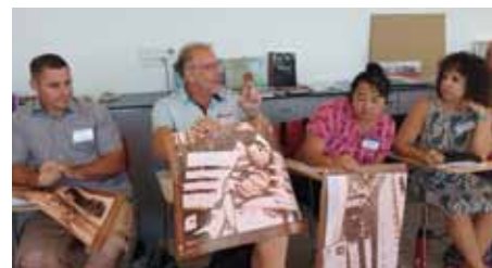
■ “Echoes and Reflections” teachers learn how to use visual tools in the classroom

The fact that the seminar took place in Israel was particularly meaningful for the group. Together with the program coordinators, the new graduates have already begun planning follow-up projects, including webinars and other e-learning opportunities. “The participants recognized that they have become leaders in