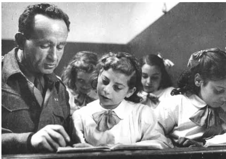
■ Members of the Jewish Brigade teach Hebrew to Jewish schoolchildren in a DP camp in Italy, after WWII.

information to allow for a more accurate and comprehensive background of the writer and/or recipient (see back cover).