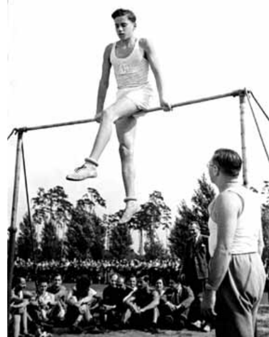
■ Gymnastics at a sports event for Jewish schools, Gruenewald sports ground, Berlin, Germany, 1935.