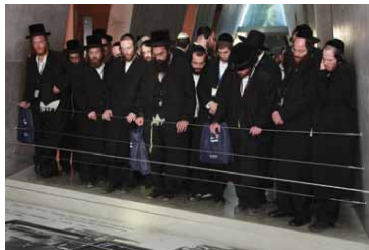
■ Seminar participants tour the Holocaust History Museum

“It was on the one hand an opportunity to summarize our achievements, and on the other an opening for future activities aimed at bringing ultra-Orthodox teachers the newest pedagogical tools and knowledge in the fields of Holocaust education and research, while emphasizing the struggle of observant Jews during the Holocaust.”