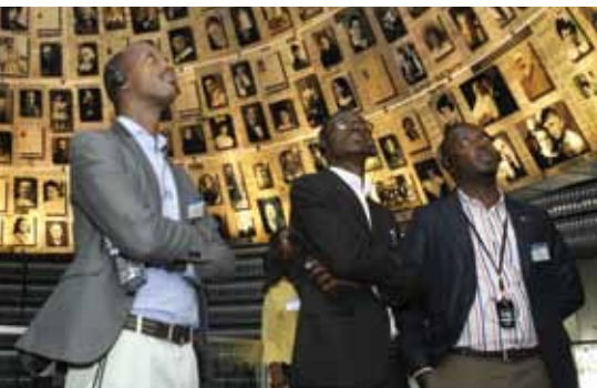
■ Members of the Kigali Genocide Memorial delegation in Yad Vashem’s Hall of Names