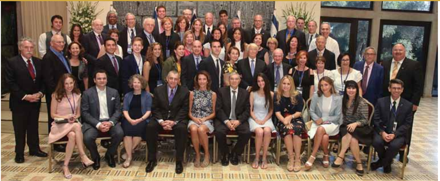
■ The Yad Vashem Leadership Mission at the Opening Reception at the President's Residence in Jerusalem.

range of educational, research and commemoration programs. Additionally, they visited an IDF army base, enjoyed private performances by top