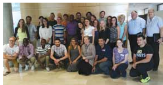
■ Young International Christian Leadership Seminar participants at Yad Vashem