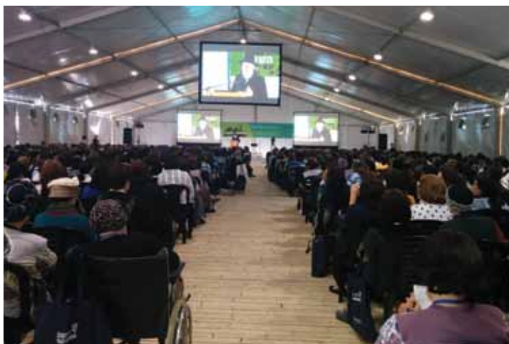
■ Ultra-orthodox teachers gather to hear the opening address of the conference, given by Rabbi Israel Meir Lau

Reactions from the participants were positive and varied. “The conference was wonderful,” said one. “You thought about every detail, and you enriched both our minds and our souls.” Another remarked that