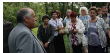
■ Graduate seminar participants visit Rumbula, Latvia, July 2016

The participants, hand-picked by the Estonian and Latvian Ministries of Education and the International Commission for the Evaluation of the Crimes of the Nazi and Soviet Occupation Regimes in Lithuania, heard lectures on prewar Jewish life in the region,