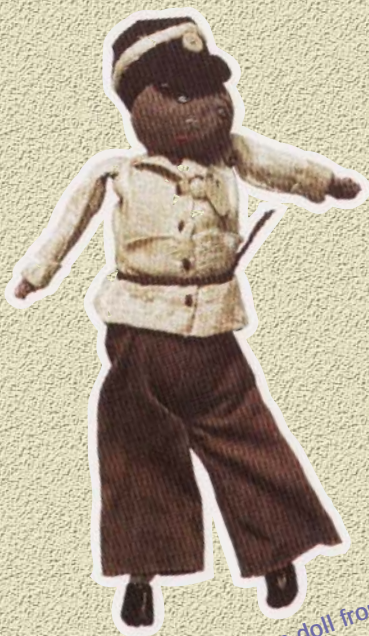
Jewish policeman doll from the Theresienstadt ghetto.