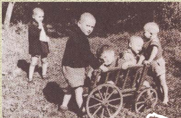
Children playing with a cart in the Coordinating Committee orphanage, 1946.