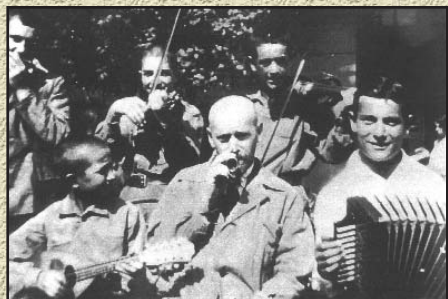
Janusz Korczak with the orchestra of the children's home in Warsaw.

This exhibition opens a window into the world of children during the Shoah . Unlike other Holocaust exhibitions, it does not focus on history, statistics or descriptions of physical violence. Instead, images of the toys, games, artwork, diaries, and poems displayed here highlight some of the personal stories of the children, providing a glimpse into their lives during the Holocaust.