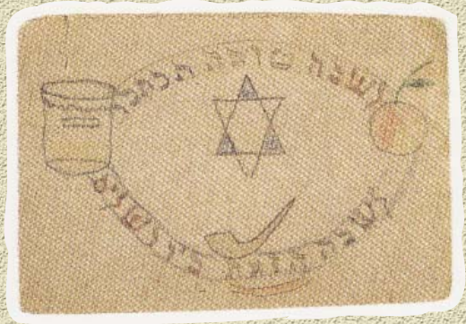
New Year greeting card sent by Vleschhouwer children to their parents, Bergen-Belsen concentration camp, 1944.