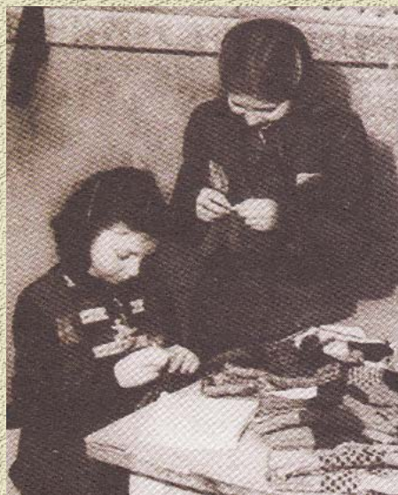
Girls learning to knit in the Lodz ghetto, 1944.