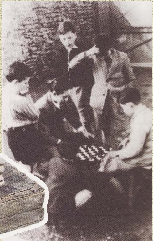
Children in hiding playing chess in the children's home in the Chabannes chateau, France.