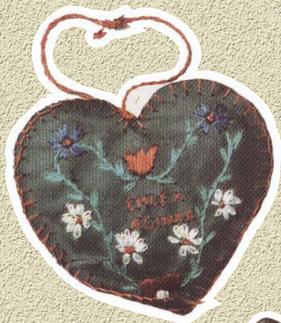
Embroidered cloth heart inscribed: "A souvenir for Agi."