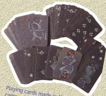
Playing cards made in the Majdanek death camp.