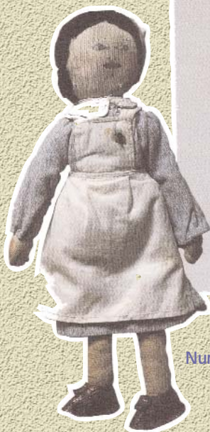
Nurse doll, Theresienstadt ghetto.