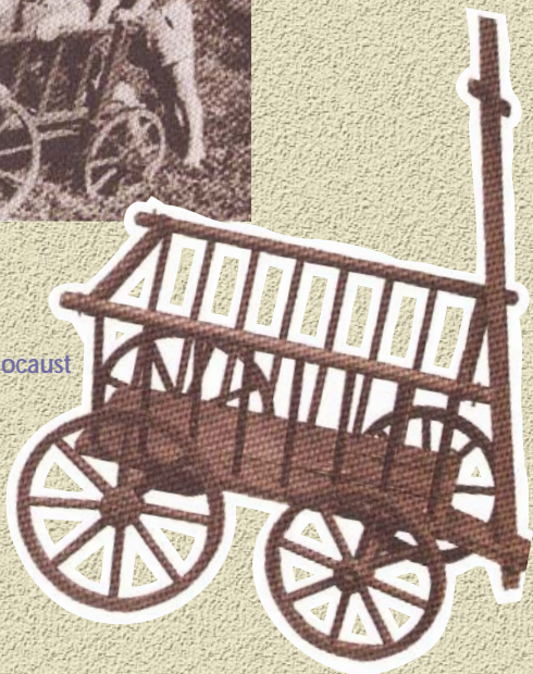
Toy wagon brought to Israel by Holocaust survivors from Germany.