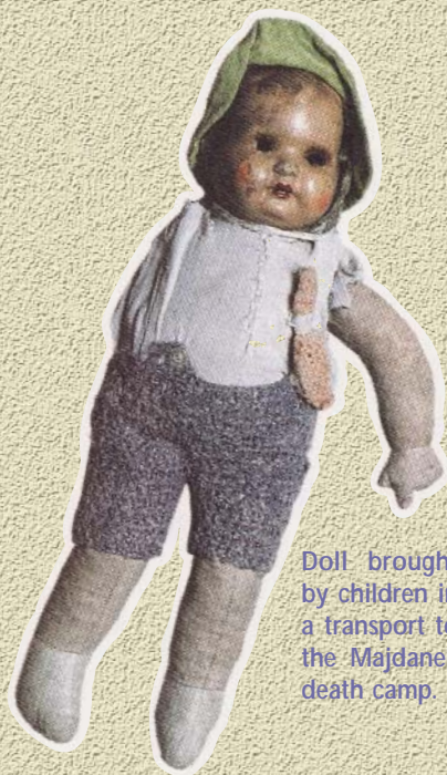
Doll brought by children in a transport to the Majdanek death camp.