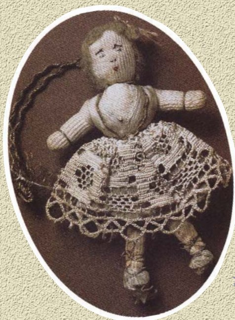
Doll found in the Buchenwald concentration camp.