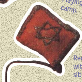
Red felt rectangular pouch filled with Torah scroll fragments, possibly used as an amulet.