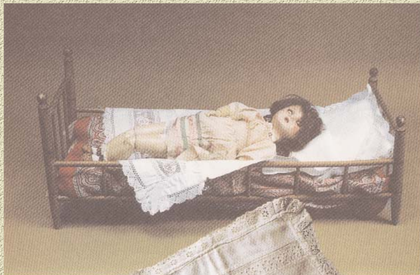
Blanket cover for the doll Colette's bed.